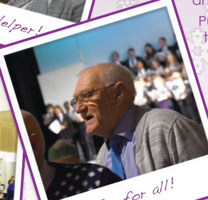
Fun for all!