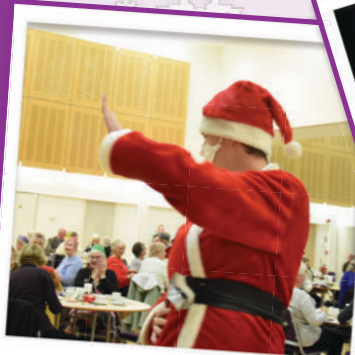
A special visitor!