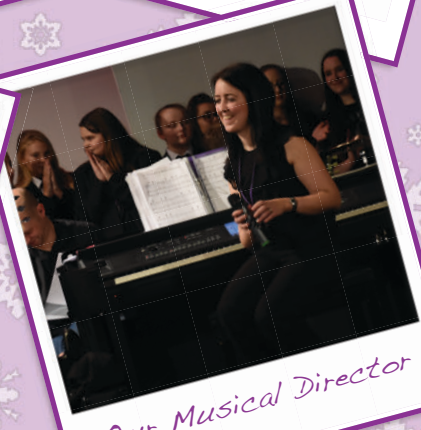
Our Musical Director