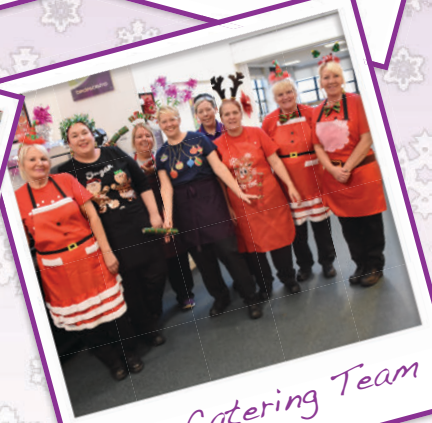
Our Catering Team

Our famous Christmas lunch was once again served up with heaps of festive spirit on the penultimate day of term.